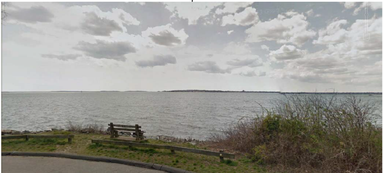
View of Narragansett Bay from Bay Spring.