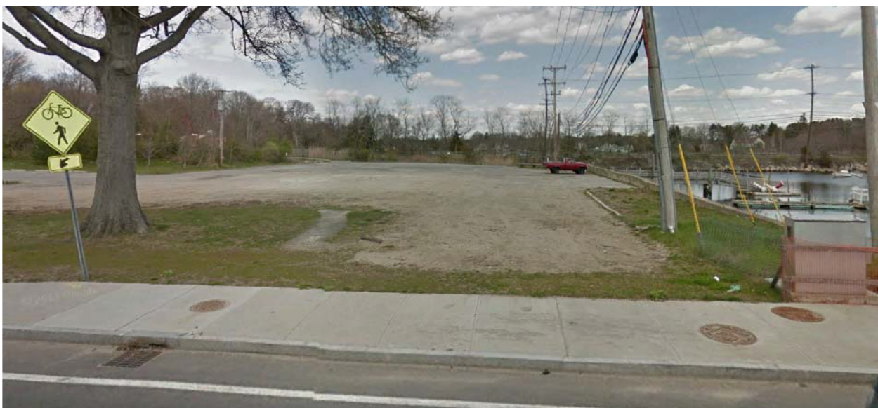
Figure 1: Site of Town Park at “Police Cove” (Before Construction)

The “Police Cove” site on County Road at the Barrington River will be redeveloped as a park.