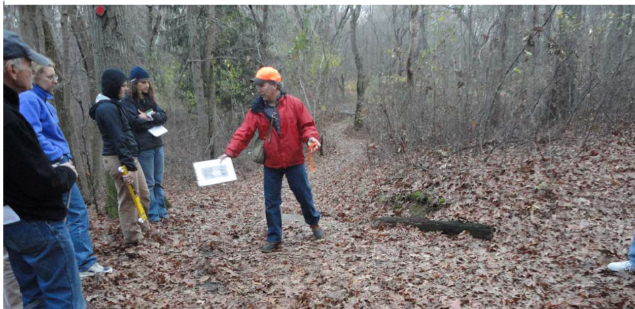
Figure 5. In 2011, the Town began working with the National Park Service to develop a passive park improvement plan for Veterans Park.