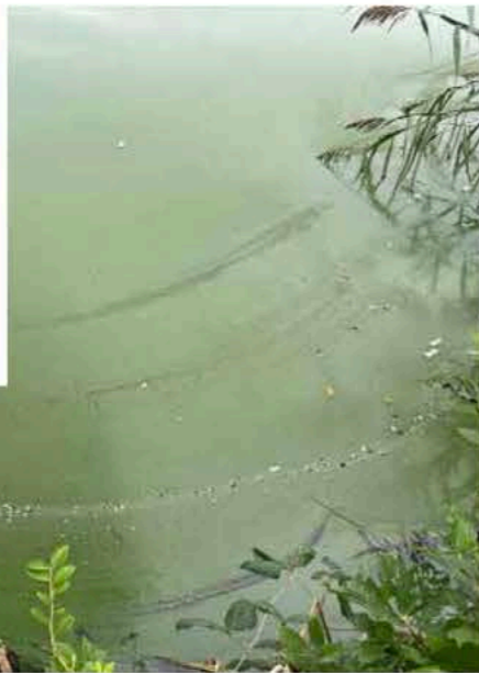
Brickyard Pond in early September 2021

Are you concerned about your child's speech or physical development?